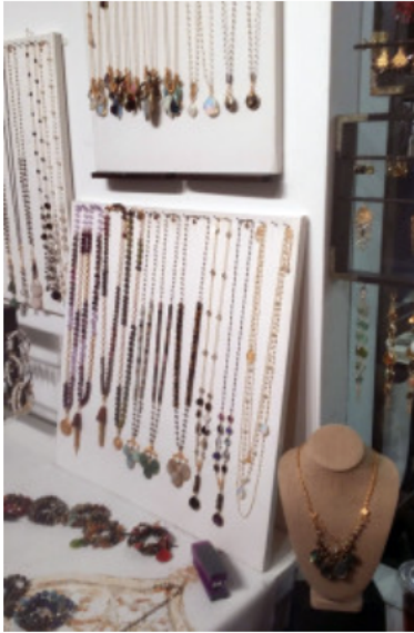
The jewelry display at Wardrobe features several local designers.

At Wardrobe that means a focus on goods designed or created locally, as well as more mainstream brands that donate a portion of their sales to a good cause or promote global artisans with fair-trade projects. Before moving to Houston in 2000, Carmichael-Grant owned a personal shopping business in England, and she's planning to incorporate a similar personalized service at Wardrobe in 2015.